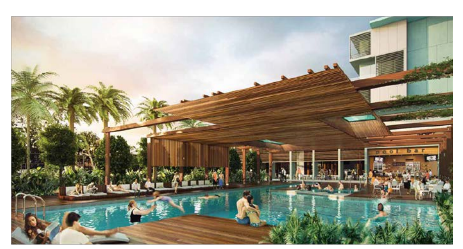
View of Recreational Pool

It is recognised that the particulars of the site development will be subject to detail design, having particular regard for any light attenuation requirements associated with elevated portions of structures. On completion of the amendment, detailed site development plans will be lodged with the Council for assessment.