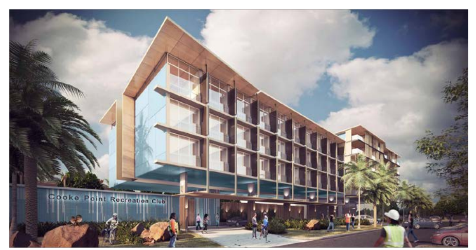
View of Keesing Street Entry