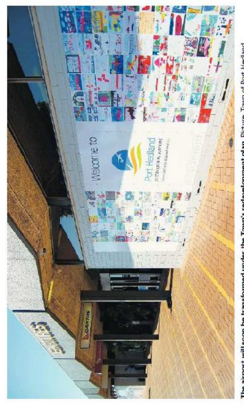
The airport will soon be transformed under the Town's redevelopment plan.

terminal will be removed. A site briefing will be held on Friday, January 24, and respondents are asked to register with online at porthedland.wa.gov.au. Interested parties can also re-Tender documents are available quest a copy with the Airport Redevelopment team at the above email. The tender closes on Tuesday, eaadmin@porthedland.wa.gov.au. February 4 at 2.30pm