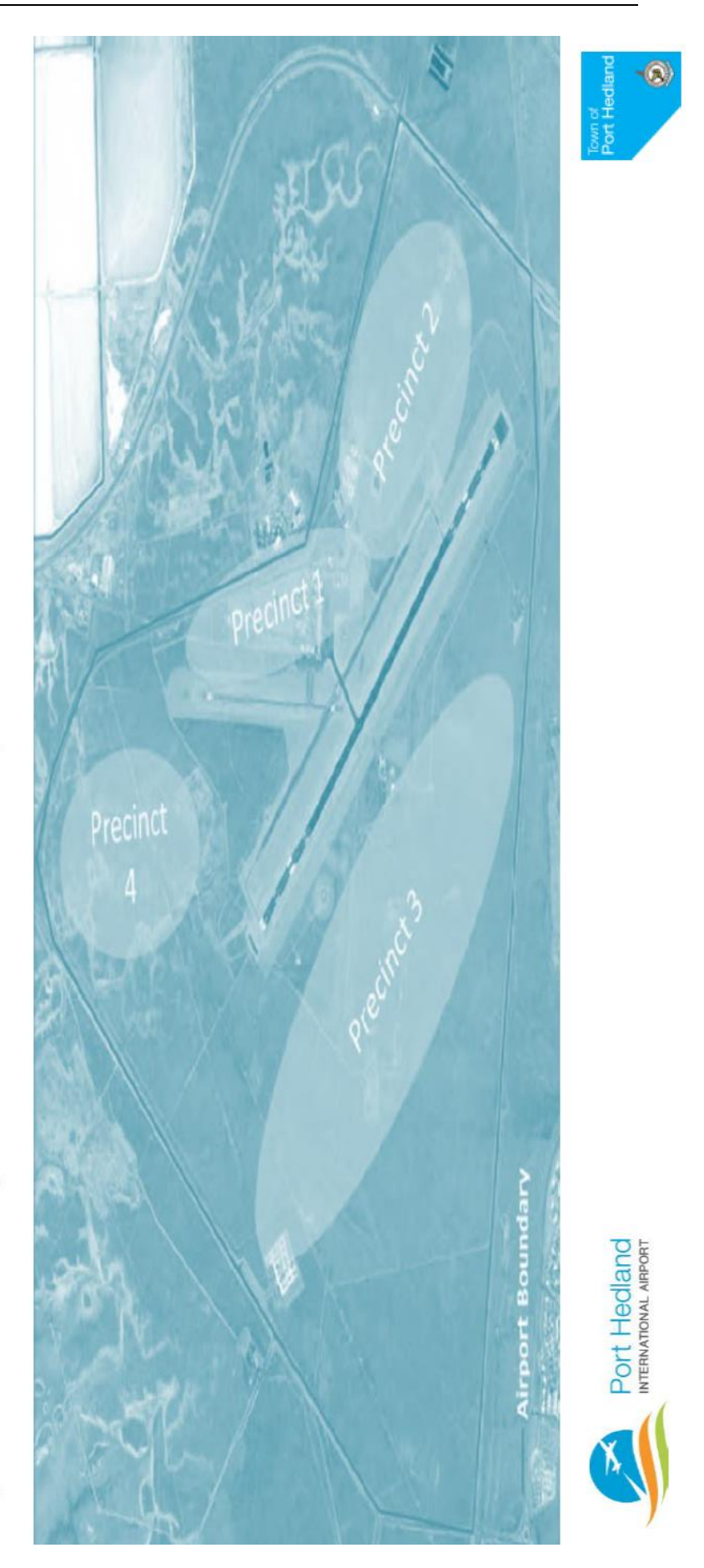
presentation to airport committee 5 February 2014