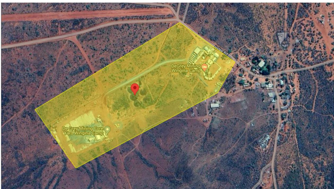
L45/578 Wingina Mining Camp and Coreyard Camp

legislation and Town's differential rating basis approach. The Town seeks approval from Council to apply to the Minister of Local Government to change