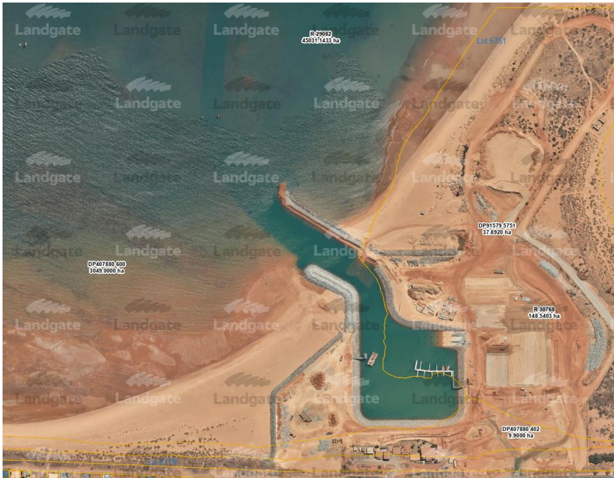
Map showing existing historical land boundaries