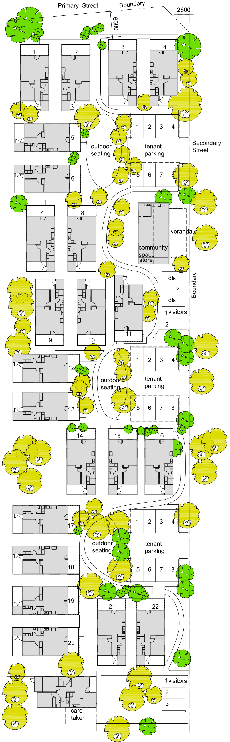
PROPOSED NEW SITE LAYOUT