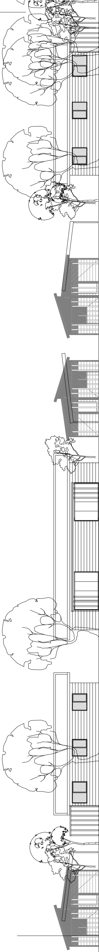
PART EASTERN ELEVATION SCALE 1:200