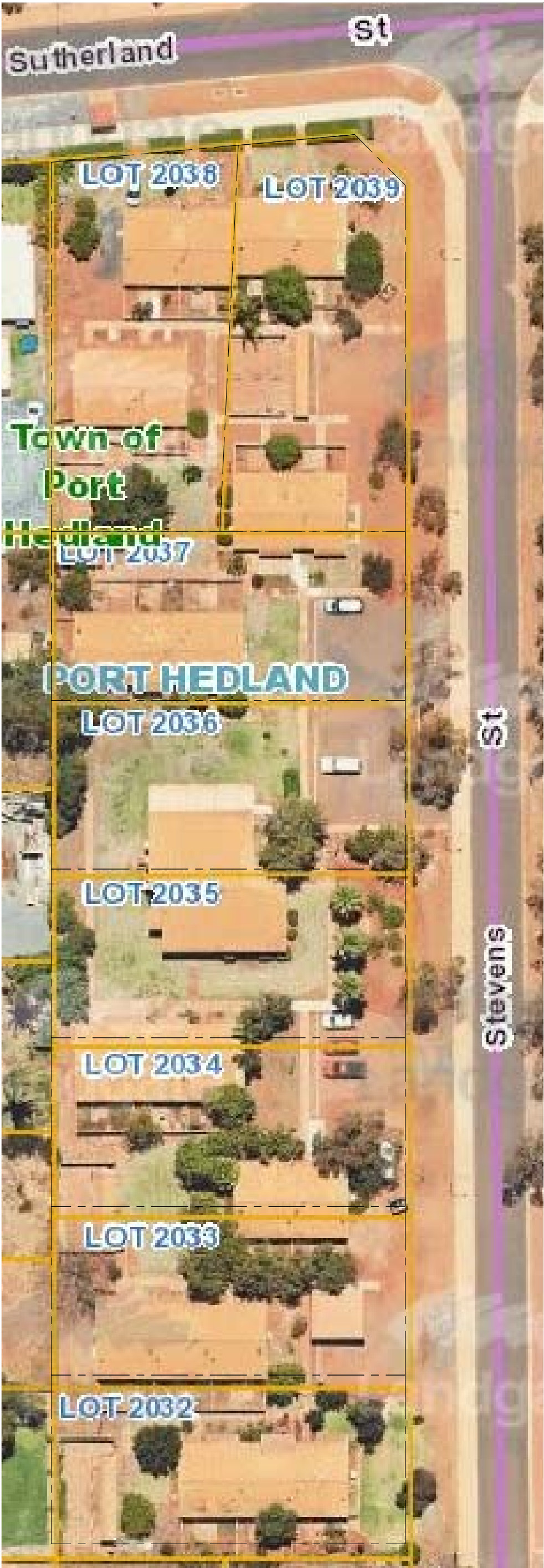
EXISTING SITE LAYOUT