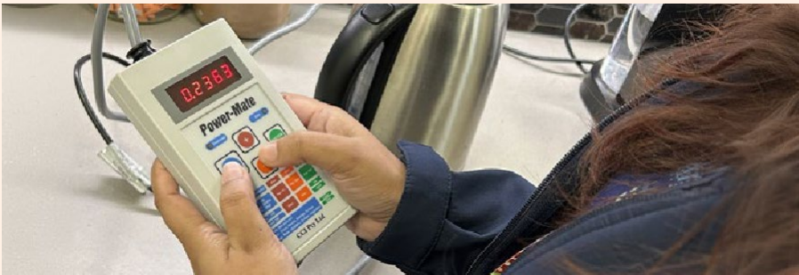
Pictured: Power-mate meter in action

Residents that are interested in hiring out the kit can contact the Town's Sustainability Advisor, Rupa Khatri via 08 9158 9300 or rupa.khatri@porthedland.wa.gov.au