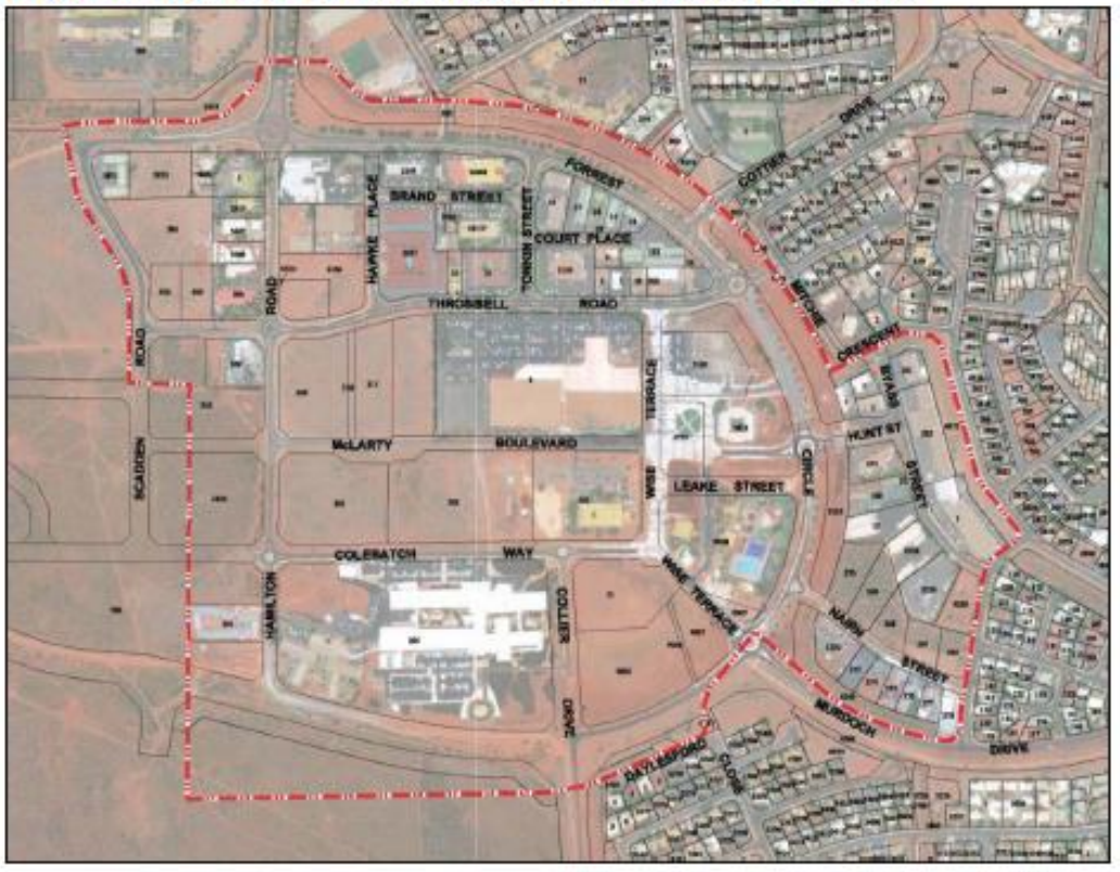
Figure 1 - South Hedland Town Centre Boundary