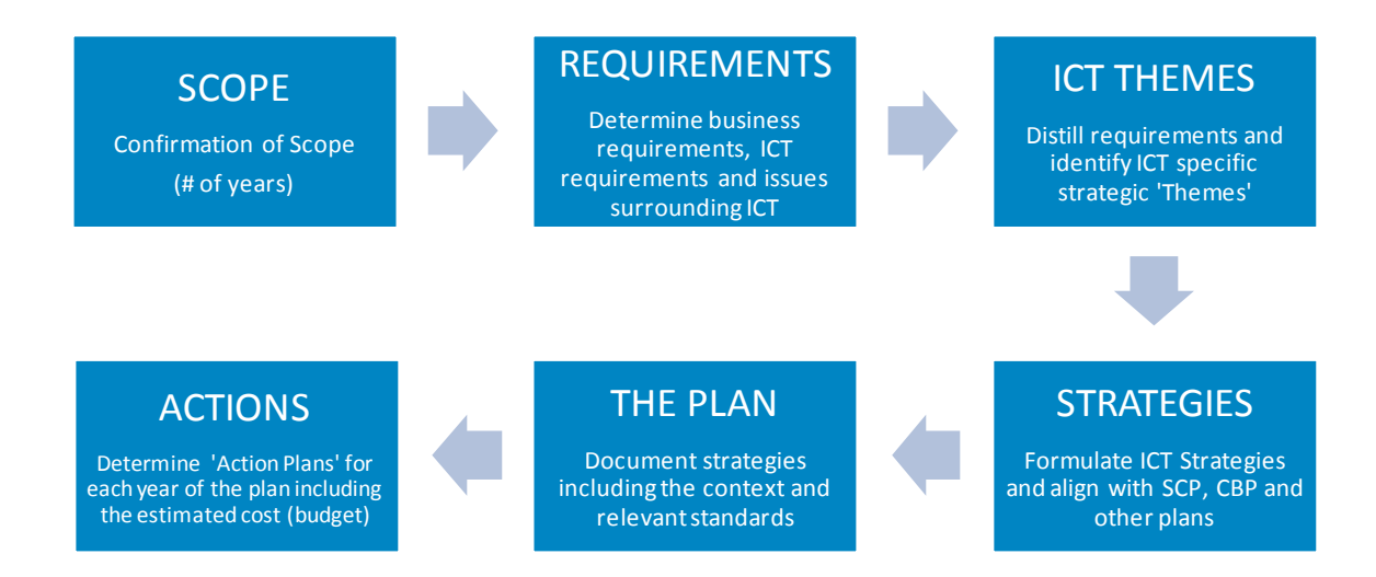
Figure 2 - Methodology to develop the Plan

A simple methodology was used to develop this plan and consisted of the stages shown below.